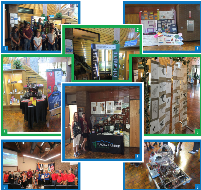
FUSD STEM Display at City Hall